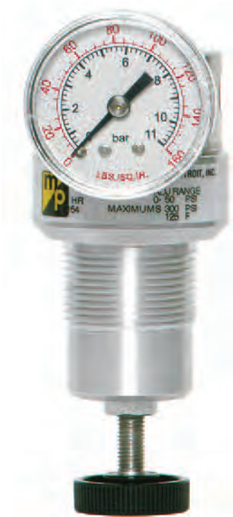
Model Shown: R57M-2G