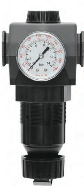
Model Shown: R380-6G