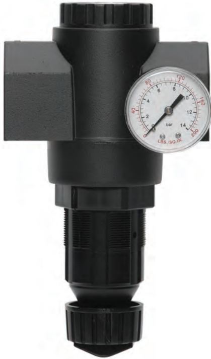
Model Shown: R180-10G